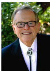
Tweed course chief director