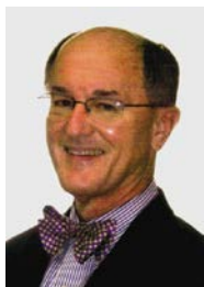
Tweed course Co-director

Balance and harmony of the face is a fundamental goal of orthodontic treatment. Every patient who has a malocclusion which adversely impacts his/her facial esthetics desires to have pleasing facial proportion as a result of treatment. This presentation will present the prerequisites for balance and harmony of a face. Case reports that illustrate diagnostic and treatment planning concepts that insure facial balance and harmony will be a significant part of the presentation.